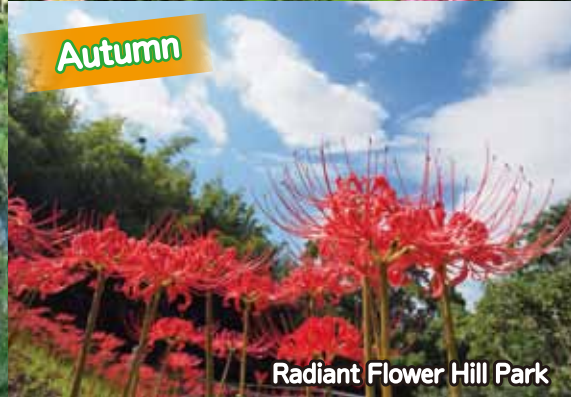
Radiant Flower Hill Park